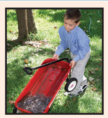
DRAIN standing water in your backyard and neighborhood – bird baths, old tires, flowerpots, and clogged rain gutters. These are mosquito breeding sites.

If you have symptoms that include stiff neck, high fever, or severe headache, contact your health-care provider immediately.