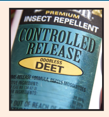
DEET (N, N-diethyl-m-toluamide) is an ingredient to look for in your insect repellent. Follow label instructions, and always wear repellent when outdoors.